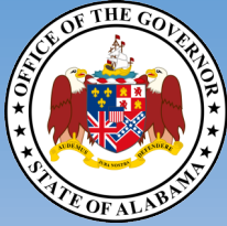
Kay Ivey Governor